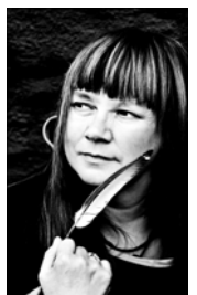
Mari Boine