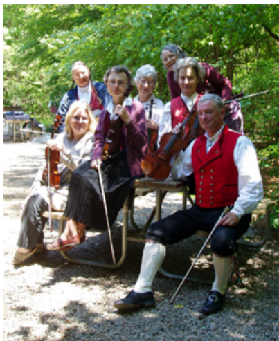
The Triangle Spelmanslag

The Triangle Spelmanslag (Scandinavian folk band) studies and performs traditional Swedish and Norwegian folk music. Located in Chapel Hill, North Carolina, these musicians use instruments such as fiddle, tramporgel (pump organ), nyckelharpa, bass fiddle and spelåpipa. For more